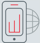
Monitoring & Control MCS

Our end-to-end solution simplifies operations management through abstraction and automation, scales as needed depending on mission needs, and increases responsiveness at a lower cost. Designed specifically for constellations, it is highly customisable at all levels. A single-user interface gives access to all the core capabilities: