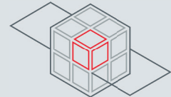
Flight Dynamics FDS

The platform aggregates data to facilitate investigations and uses powerful APIs to maximise interoperability with other solutions. Data from different assets can be combined through plots and dashboards for real-time visualisation.